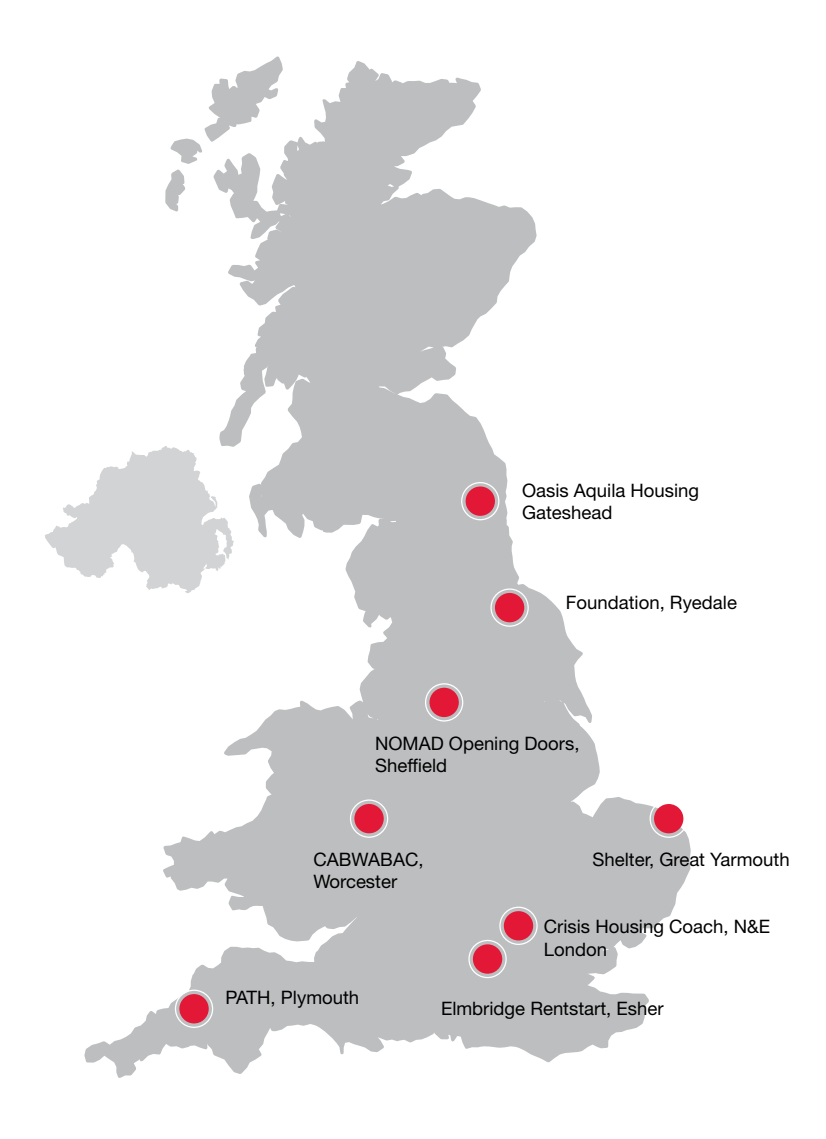
Figure 1.1: Geographical coverage of the Sharing Solutions programme