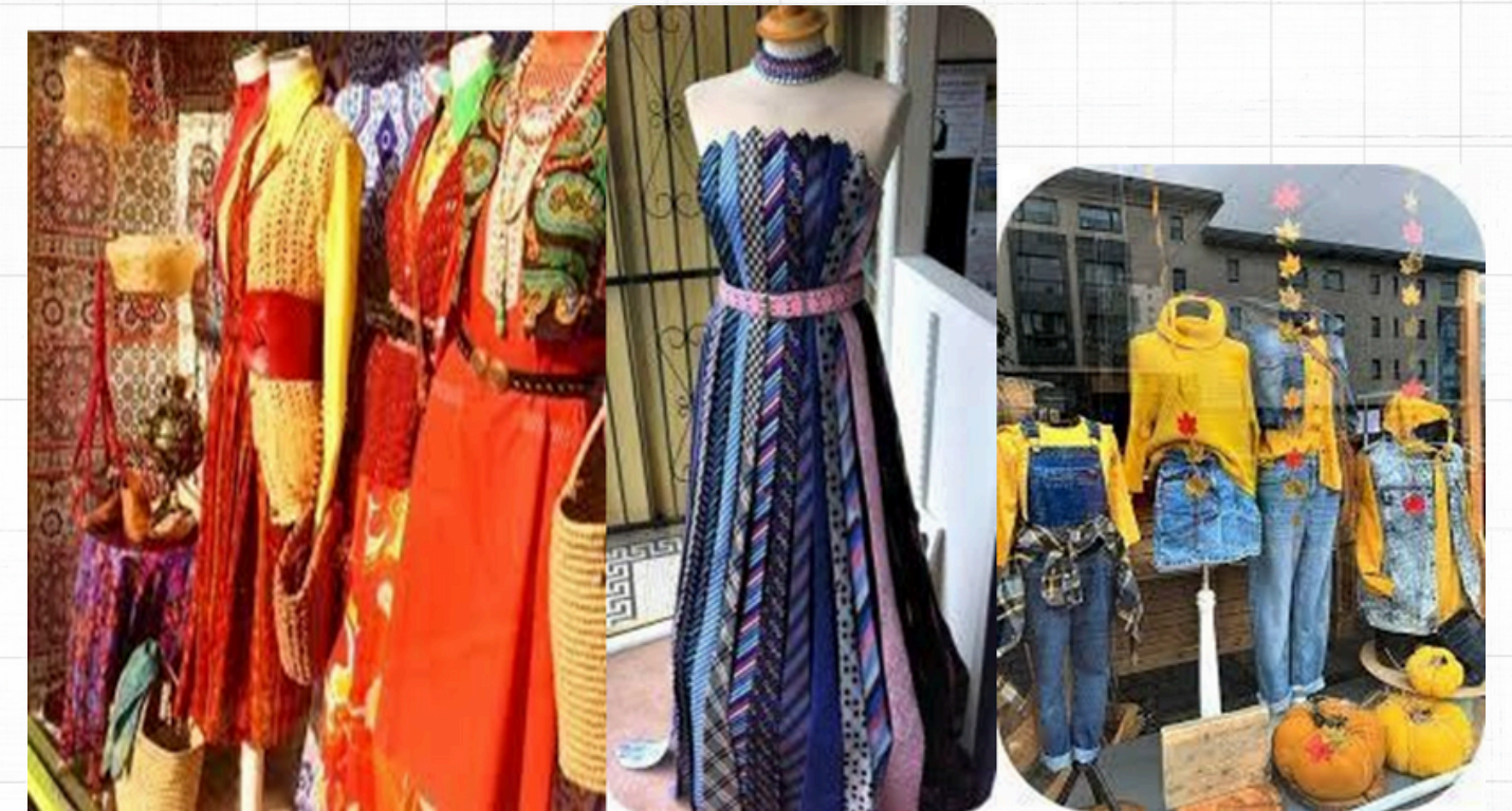
(Some examples of displays in our Crisis Peckham store)