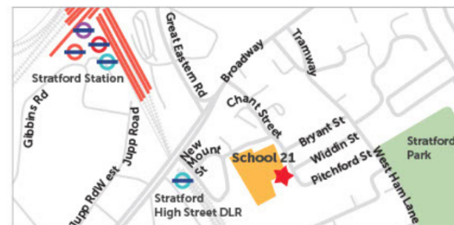
Stratford Day Centre, School 21, Pitchford Street, Stratford, E15 4RZ